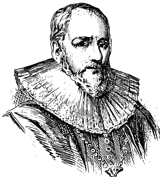
Sir Hugh Myddelton

Sir Hugh Myddelton is chiefly remembered as the man who brought fresh water to London. This is how residents of Myddelton Square, in the London Borough of Islington, tend to think of him and perhaps to associate him with the statue at Islington Green.