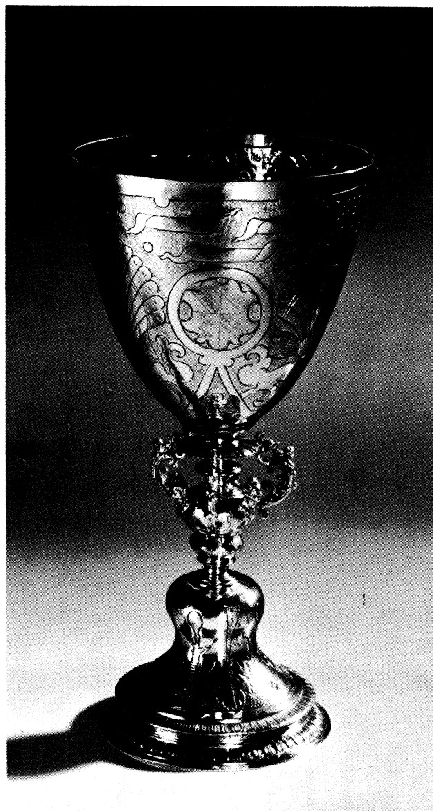
The silver cup presented by Sir Hugh Myddelton to the Corporation of Denbigh and now in the possession of the Goldsmiths' Company