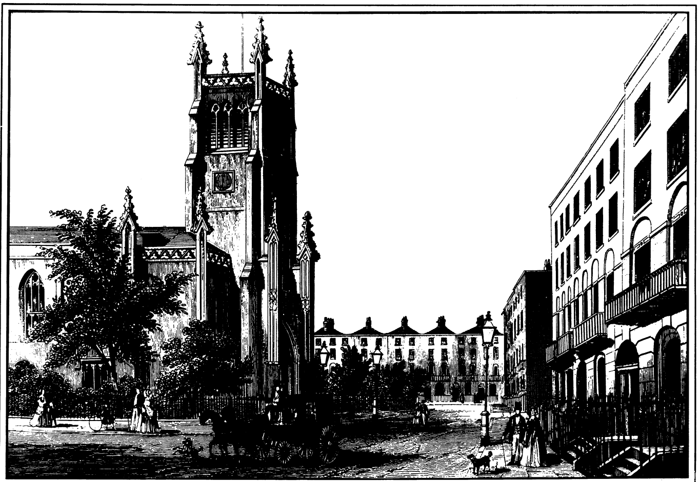
The Church of St Mark the Evangelist in Myddelton Square circa 1830

Sir Hugh Myddelton: a man full of enterprise and resources; an energetic and untiring worker; a great conqueror of obstacles and difficulties; an honest and truly noble man, and one of the most distinguished benefactors the City of London has ever known.