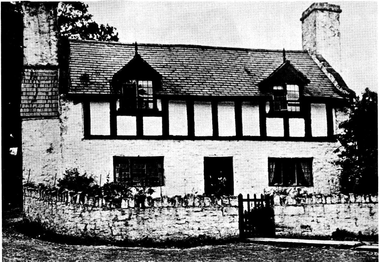
Galch Hill near Denbigh, birthplace of Hugh Myddelton

But the years between were financially hard for Hugh. By May 1610, he had spent £3,000 of his own money, had got as far as Enfield and virtually bankrupted himself. His attempts to get additional financial assistance met with opposition from the City and Parliament. Work had no sooner begun than a host of opponents sprang up. Owners and occupiers of lands strongly objected and presented a petition to Parliament. Fortunately, Parliament adjourned in July 1610 and did not meet for four years, by which time the project was virtually completed. More time was granted to Hugh by the Common Council, but by 1612, opposition was so strong that Hugh sought help from King James himself, who agreed to bear half the expense for a half share of the profits. An agreement was signed under the Great Seal on May 2 1612. As work proceeded, the derisive voices quietened and by 1613, the King, Corporation and citizens vied with each other in honouring the 'brave and patriotic Hugh Myddelton'.